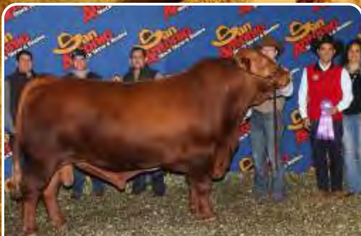
MBJ FAGAN DAKOTA 201D8

* His maternal sister, Miss 201X was Houston & San Antonio Senior champion.