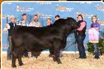
TRIO'S MLS ZEUS 175Z4 son: MCC Corona 75C