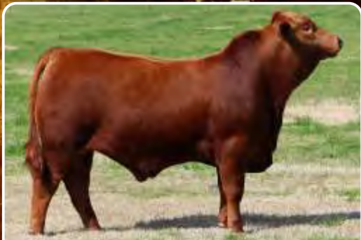
Son of Ferrari