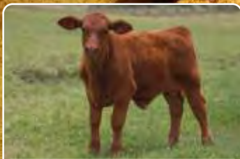
MBJ Conan 768 Calf

*His Sire Prince 30W is an 880P son. Prince' show career included the Houston Livestock Show.