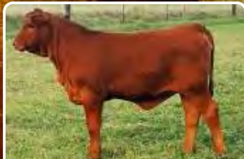
MBJ Red Cash calves

* Use Red Cash for proven foundation Red Brangus genetics with optimum breed characteristics. the U.S.A.