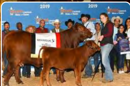
MBJ Lilly 225C2 - IBBA Grand Champion Cow Calf Pair