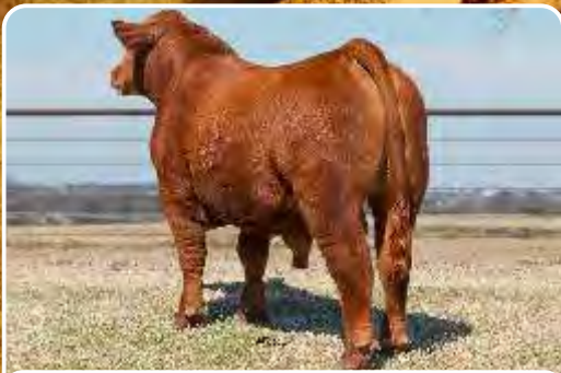
TRIO's MLS CORTEZ 175C6

* Cortez's pedigree of Tanque 23T x Wildfire 175W offers world class quality, style and performance.