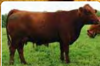
Daughter of Wiseguy, TRIO's MLS Yolanda 175Y