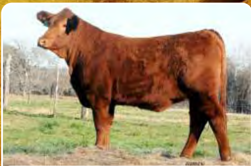
Red Ace Heifer