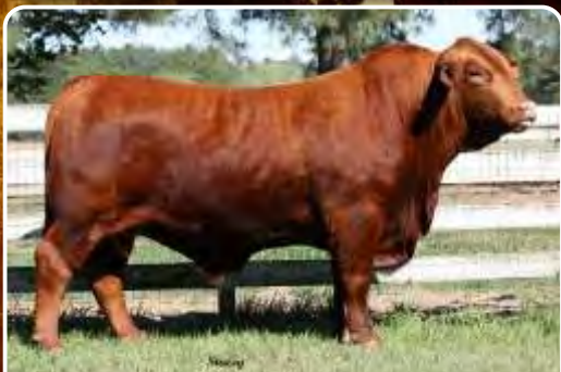
Legacy son: Superman