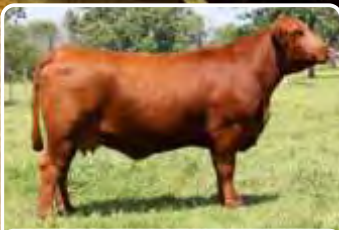
Dam of Coronel: Miss Fancy 175/4