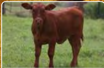
Charlie 204M3 Daughter SM

* His dam Sureway 204M, is one of the elite marquis donors of the Red Brangus breed. Dam of many renowned icons of the breed like OB Red Bull, OB LEGO, OB Charlie 204C3, OB Cristal 204C2.