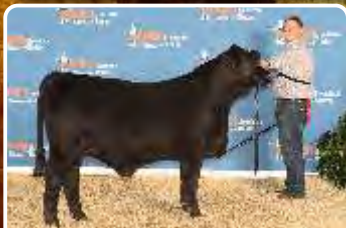
TRIO's MLS Zeus 175Z4 daughter TRIO's NCC Chelsea 68C