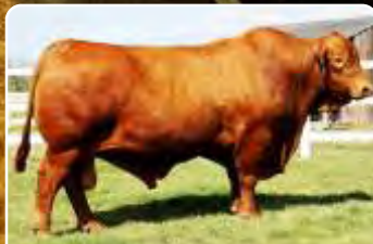
Sire: CX TANQUE 23/T

*Use Red Fire to add depth of body, muscularity and eye appeal without sacrificing real world function.