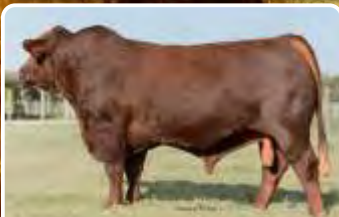
TRIO'S Coronel full brother TRIO'S Yucatan 175Y