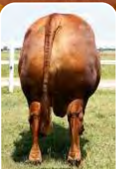
Red Bull back