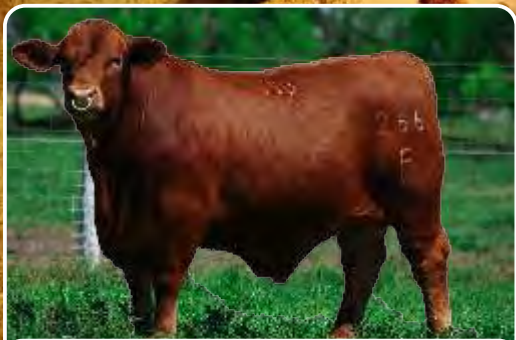
Son of Tanque: MJB Fireman

* Progeny include National and Grand Champions Bulls and Females in Argentina, Brazil, Mexico and the U.S.A.