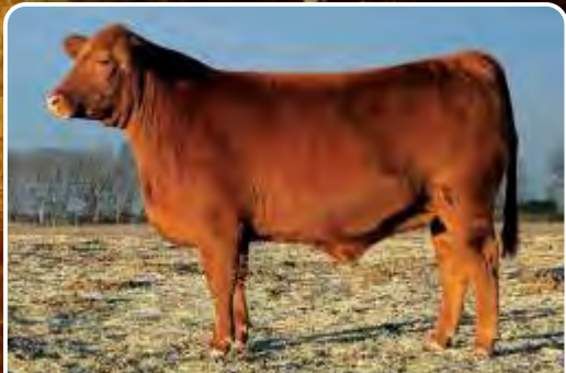
Daughter of Tanque, TRIO's Yelena 175Y3