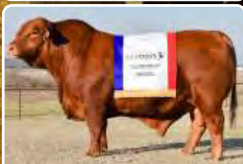
CEO 175C5, National Reserve Grand Champion Bull