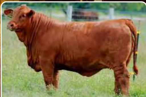
Daughter of Talent: 090 Prog 124F