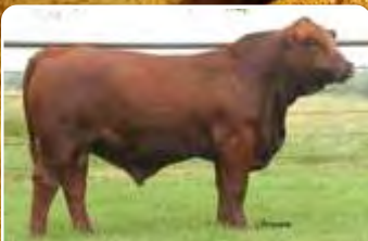
TRIO'S BALCO CORONEL 175C2

* Calves have been born light and thrifty