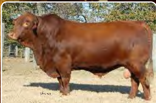
Sire of Triumph, Lazy 3 Statesman 100S