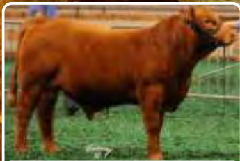
MBJ Wiseguy 269W Showing Closeup

* Since then he has been named Grand Champion of the National Show of Merit and Reserve Grand Champion of the Western National.