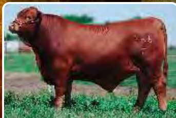
MR MJB RED FIRE 266F

* MJB Braxton 266B is his maternal brother. Redfire offers many qualities that will appeal to purebred and commercial breeders worldwide.