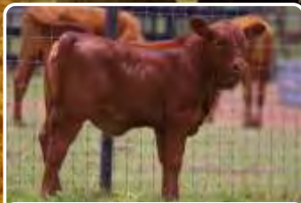
OB 204C3 Charlie 2019