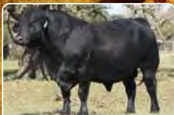
MBJ - TRIO'S ZEUS 175Z4 (PV)

* A well balanced slate of EPD's with high carcass merit.