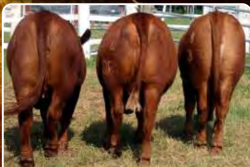
Red Bull heifers