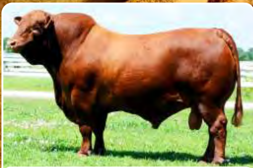
Son of Extra Talent: MBJ Red Cash A/84Y

* OB Extra Talent 971 is a very correct bull with deep muscling, moderate frame, thick, square design, and sound structure.