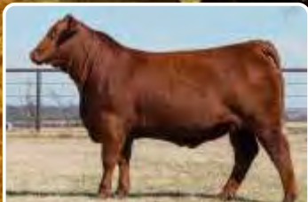
Daughter of Red Cash: TRIO's Cleopatra 175C

* Heavy musculature, tremendous depth, sweeping rib cage, stout bone and length of body. He has very correct skeletal design, structure and stride covering his tracks with a long fluid stride.