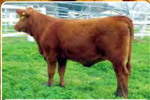
Daughter of Ferrari

* Ferrari 204X2 dam's, 204R3 is one of the few Red Brangus Summit Cows in the breed and is a maternal sister to Red Bull 521W. His full sisters were Show Champions, and both have full brothers that are herd sires.