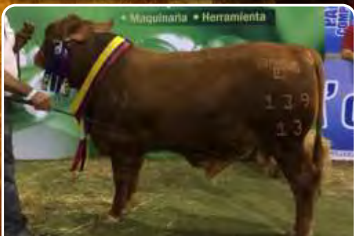
Red Ace Progeny