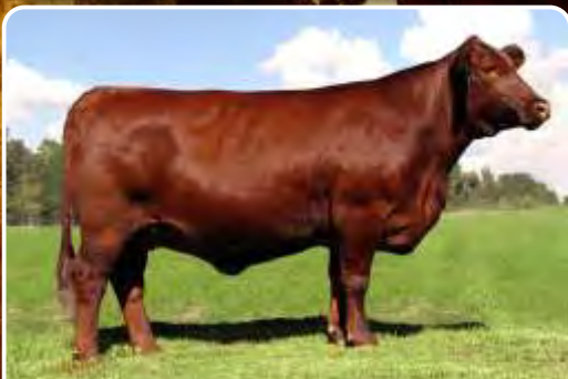
Dam: TRIO'S Wildfire 175W