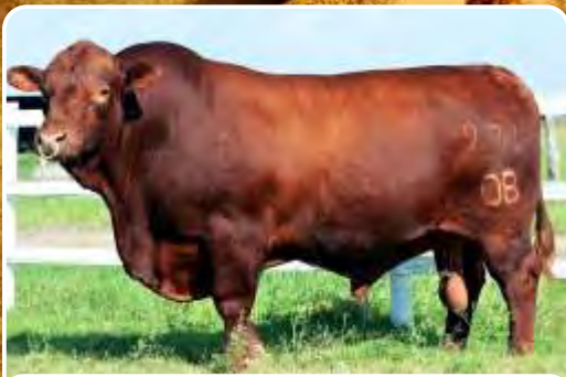
Son of Talent: MR PB Extra Talent

* His natural muscle, bone and capacity can help any Red Brangus breeder." 090N is perfect to be used on nelore Genetics. He ads bone, muscle and capacity.