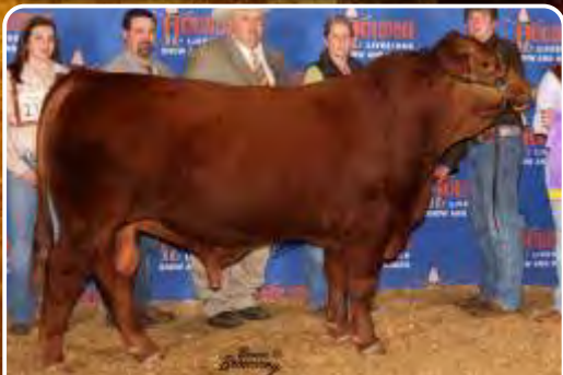
ARBA National Grand Champion