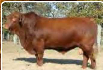
Sire: Lazy 3 Statesman 100S