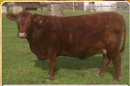
Dam of Prince: R2 Mimi 841P