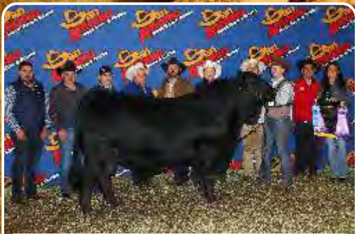
MBJ MARY A DOLLAR

* Appreciate his power, depth, bone, muscle, heavy muscled, aye appeal, short hair, functional skeletal and structural design. His dam is our Fancy donor out of a Hercules daughter and a Burtins Transformer daughter.