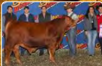
MR MJB RED FIRE 266F

* San Antonio Calf Champion 2019 –Power, depth, bone, muscle and eye appeal. MJB Red Fire 266F blends the genetics of two of the most widely recognized sires in the breed, Tanque 23T, and Legacy.