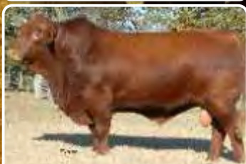
Sire of Wiseguy, Lazy 3 Statesman 100S

* Wiseguy is a powerfully constructed, moderately framed individual that offers the breed a well-balanced phenotype. In his first showing at 10 months of age, he was named Grand Champion at the 2010 San Antonio Livestock Show.