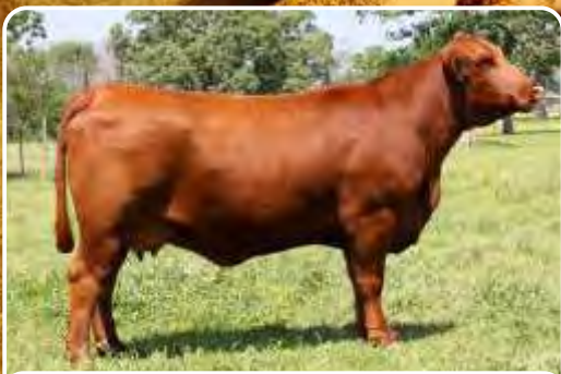
Dam of Triumph, Miss Fancy 175/4

* Triumph's dam is a true Red Brangus matron. She is a moderately framed, big-volumed, and beautifully designed female with a well-balanced udder.