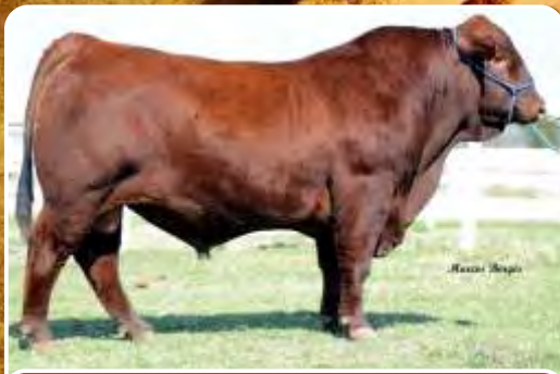
Red Bull calves 916

* Moderate frame, very deep, powerful, heavy muscled, and big-boned with very clean underline