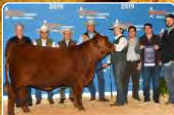
Daughter: MJB RBF Elegance 204E

* Well balanced EPD slate, with leadership in Calving Ease, Growth and Carcass traits.